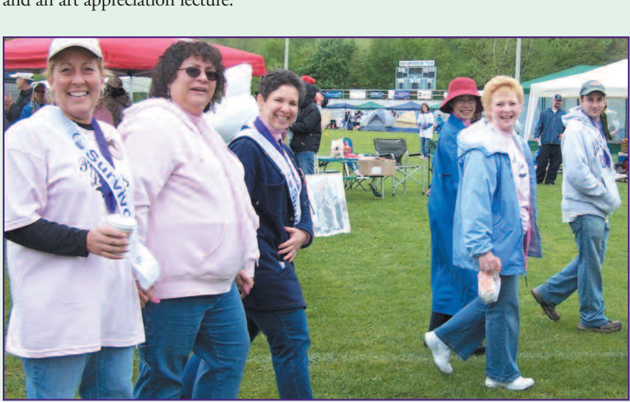
Members of the Brave at Heart Breast Cancer Support Group proudly march during the Relay for Life's Survivor Lap.

Saint Mary's Hospital One-Stop Testing Department won the 2006 Trim-a-Tree contest and donated their prize to HLRCC to be used for a breast cancer educational event.